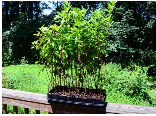
Flat of 32 overgrown native azalea cuttings

Plants that have been through such an ordeal will need time to recover. Putting them in open shade and misting the foliage helps, but they shouldn't need such constant watering. Avoid fertilizer at first since it can burn delicate new roots. Light applications are OK after several weeks but don't fertilize too late in the season. Plants need to go into dormancy before fall, and a late flush of growth makes them vulnerable to winter damage. By next year, the plant should be fine.