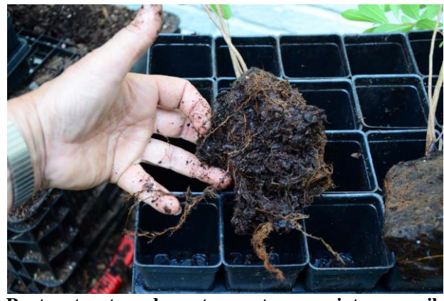
Root system teased apart so roots can go into new soil.