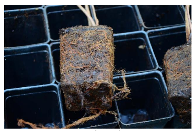
Dense tangle of roots in the pot