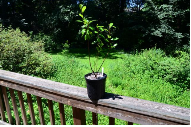
Repotted plant ready to grow on.