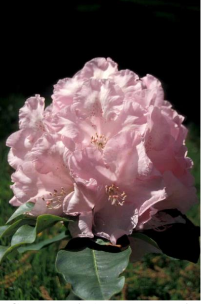
Greer Hybrid 'Trude Webster'