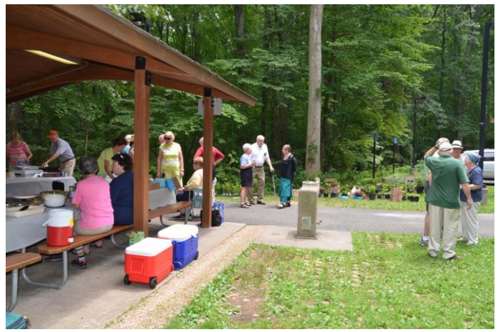
Picnic gathering at Seneca Creek State Park