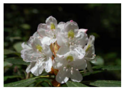
R. maximum flower

the west coast of North America. [1][2][3] These are some of the hardiest rhododendrons in the genus, many of which have been popular parents in hybridizing.