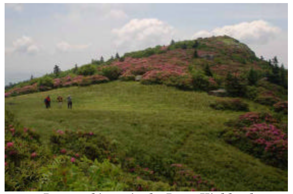
R. catawbiense in the Roan Highlands

"No advance description could equal the magnificent spectacle of lavender-pink flowers in a vast billowing sea reaching out to the misty violet horizon of the mountains. Surely this is one of the great floral scenes of the nation, a vista of immense drama in a majestic setting." [9]