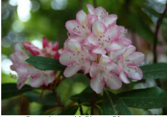
R. maximum with Picottee Blossoms

blench the cheek of either an All-American fullback or a fan dancer." [9]