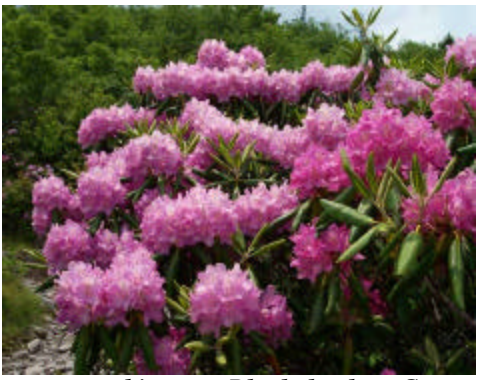
R. catawbiense at Rhododendron Gap

The R. catawbiense populations along the Blue Ridge Parkway in Virginia are clearly the most diverse we have found. There are excellent color variations found at low