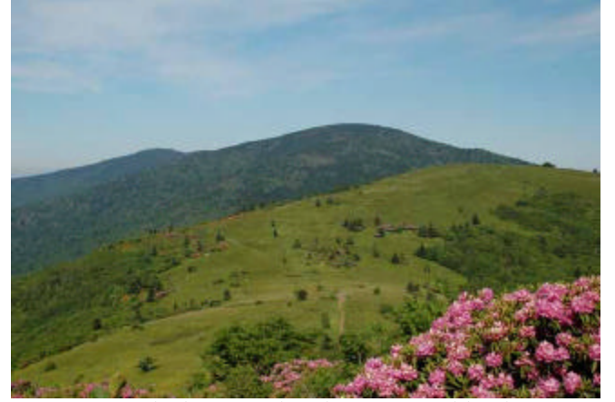
Appalachian Trail in the Roan Highlands

There are many popular places to view R. catawbiense along the Blue Ridge Parkway, such as the Peaks of Otter in Virginia or Craggy Gardens in North Carolina. Undoubtedly, the most impressive display is on the border of North Carolina and Tennessee in an area known as the Roan Highlands. This is a region of high mountains and grassy balds near the highest peak in the region, Roan Mountain, elevation