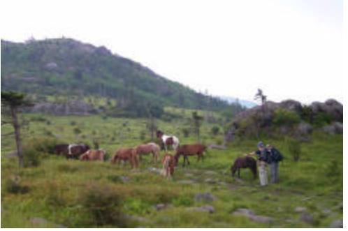
Wild Horses at Grayson Highlands

elevations along Otter Creek starting near milepost 56 that continue to the higher altitudes beyond the Peaks of Otter at milepost 84. We have seen flowers of lavender pink, deep rose pink, strong purple, pale lavender, blush pink, and some that almost look apricot due to a contrasting blotch against a pale pink corolla. Of particular interest are the white forms that we have found here.