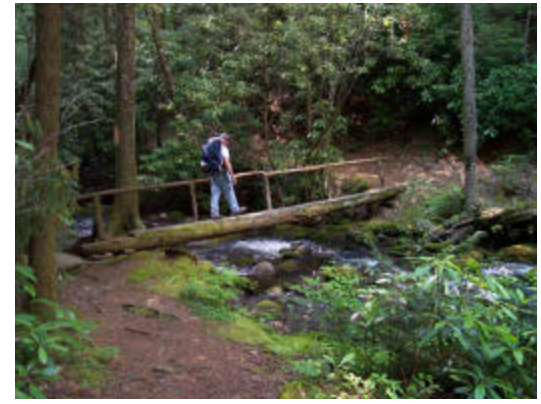
Forge Creek Trail to Gregory Bald

R. maximum is a dominant plant along many streams in the Great Smoky Mountain National Park. We have observed one population near Forge Creek for many years, since we often hike the Gregory Ridge Trail through that area on our way to a spectacular native azalea hybrid swarm on Gregory Bald. The trail begins in Cades Cove at an elevation of approximately 1800 ft. (550 m), and the rhododendrons are very dense along the first third of that trail. They are usually starting to bloom around the summer solstice when we make that hike.