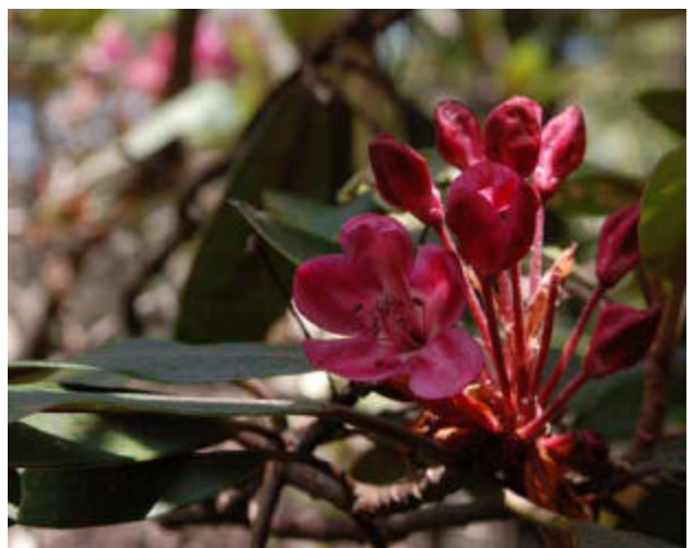
The Red R. maximum at Curtis Creek

The widest variation in R. maximum we have seen so far is near Mount Mitchell. With an elevation of 6684 ft (2037 m), it is the highest mountain in the eastern Unites States. The Blue Ridge Parkway from milepost 330, beyond the entrance to Mount Mitchell State Park, to about milepost 360 seems exceptionally rich. There are typical white to blush pink forms as seen in other locations but also stronger pinks and some that are picottee. The elevation in this area is from 3000 to 5000 ft (920 to 1520 m), so R. maximum can be in bloom from late June through much of July.