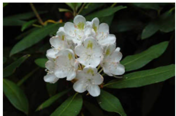
R. maximum, White Flowered Form

Rhododendron maximum , the Rosebay or Great Laurel, is clearly the most widespread of our eastern species. Its range includes most of the same areas in the Southern Appalachians inhabited by R. catawbiense but then extends far to the north through West Virginia, Pennsylvania, and into New York. There are scattered populations in most other New England states, Ohio, and even in Canada. [11]