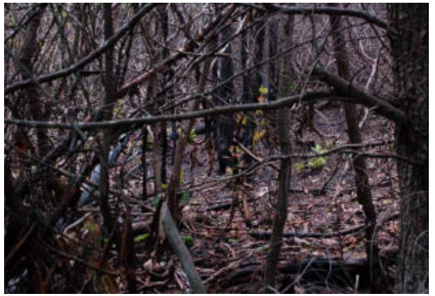
Fire Damage in the Thicket Near the "Red Max"

The winter of 2009-2010 was very rough in much of the eastern United States. With relentless heavy snows and serious ice storms, many mountainous regions, especially those near Mt. Pisgah and Mt. Mitchell, seemed to be particularly hard hit. Most deciduous trees lost large branches, and many were completely broken off. Interestingly, very few rhododendrons showed any snow or ice damage. Since ice storms are relatively frequent in the mountains, the loss of the canopy in this manner must be one mechanism by which rhododendrons that had stopped blooming due to excessive shade suddenly become exposed to higher light intensities. With more light, they will likely bloom more heavily for the next several years.