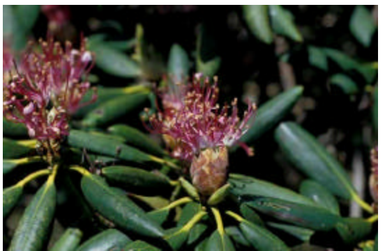
Unusual Flower Forms

Perhaps we have been overwhelmed by the sheer majesty of Roan but rhododendron variation there does not seem as diverse in comparison with other populations. Flower color ranges from light to medium lavender pink with occasional deeper tones, but we have not noticed white forms or dark purples. There are extremely fine selections, though, as fine as any ironclad. We have noticed some unusual flower forms, too, where corollas are irregular or even missing. The oddity is not uniform, so we suspect it is caused by the environment or perhaps a pathogen.