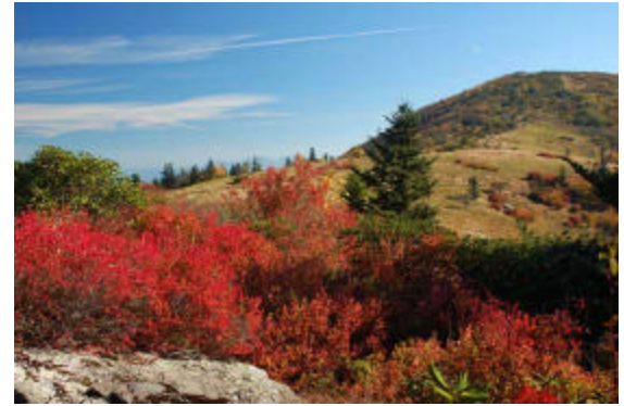
The Roan Highlands in Autumn

6285 ft (1916 m). The Appalachian Trail traverses many of these balds, and with the 360 degree views of some of the highest mountains in the east, many consider this stretch the most scenic of the entire 2175 mile (3500 km) trail. [5][8][12][15] It is gorgeous any time of year, but surely one great show is in autumn when the Vaccinium and native azaleas turn brilliant red to contrast with the evergreens. In spring when the estimated 600 acres (243 hectares) of rhododendrons burst into bloom, the sight is absolutely breathtaking.