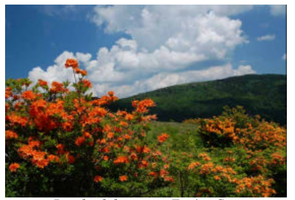
R. calendulaceum at Engine Gap

The next peak is Jane Bald, elevation 5781 ft (1762 m). The trail is more challenging here since it narrows and becomes rocky as it ascends through thickets of R. catawbiense , alder, and azaleas on both sides. Beyond Jane Bald, the trail