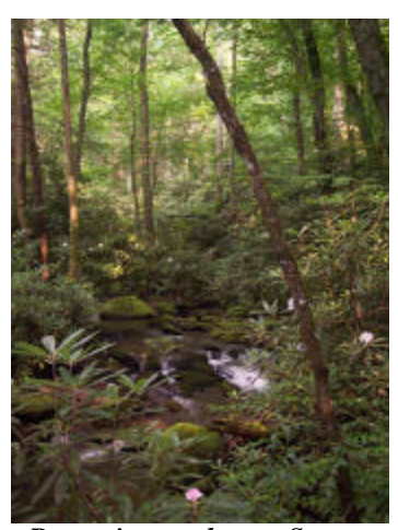
R. maximum along a Stream

Rhododendron catawbiense and R. maximum are the only elepidote species native to the eastern North America. Taxonomically, they are placed in the subsection Pontica of the subgenus Hymenanthes . This group contains an odd assortment of species from around the world, including R. ponticum from the Mediterranean, R. caucasicum and R. smirnowii from Turkey and the Caucasus, R. aureum from Siberia and northern China, R. brachycarpum from Korea, R. degronianum and R. makinoi from Japan, R. hyperythrum from Taiwan, and R. macrophyllum from