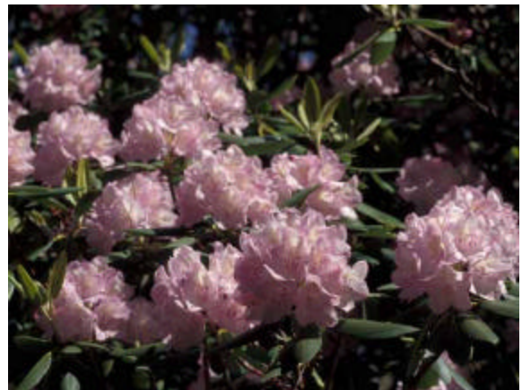
R. catawbiense, Blush Pink Form