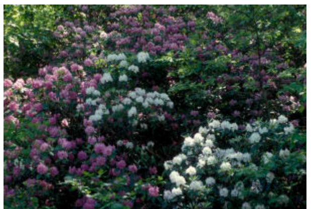
R. catawbiense variations at Otter Creek

There is significant elevation change in this area within a relatively short distance. The lowest elevation of the Blue Ridge Parkway is 649 ft (198 m) at milepost 64 where the Parkway crosses the James River. R. catawbiense blooms at that elevation in early May. The highest point on the Parkway in Virginia is 3950 ft (1200 m), barely 10 miles (16 km) away where the R. catawbiense flowers in early June. Whether the diversity we see in this area has been influenced by the elevation extremes is not clear, but it does invite speculation. Could hybridization with R. maximum in the distant past have been responsible for the wide color variations we see today?