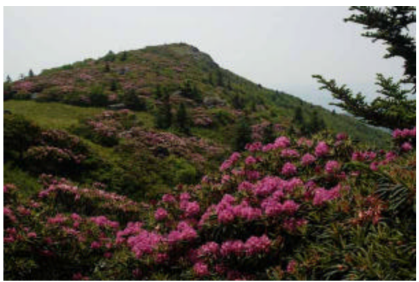
Vista of Grassy Ridge Point

The trail narrows again through dense R. catawbiense but opens near the crest to a broad expanse of grass covering the top of Grassy Ridge Bald. A rock outcropping at the summit makes a convenient stop to survey the scene, and it is easy to become mesmerized by the long grasses waving in the cool breeze with lavender pink rhododendrons, gray granite outcroppings, and mountain views in all directions.