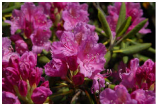
R. catawbiense flower

along streams. Both species are relatively adaptable, though, so it is not uncommon to find R. maximum on a mountaintop and R. catawbiense growing beside a woodland stream.