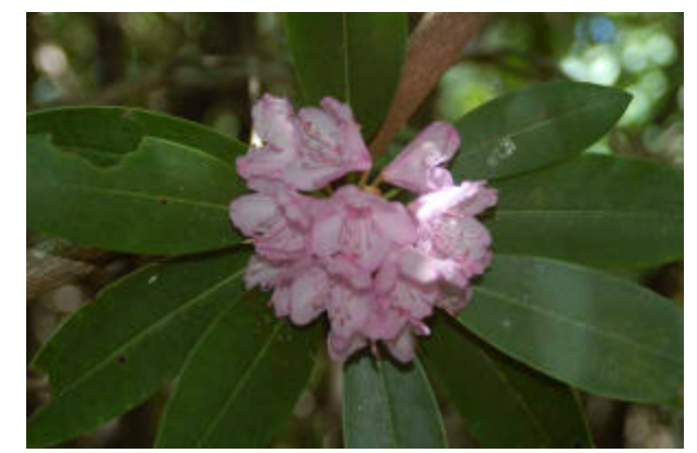
Natural Hybrid of R. catawbinse and R. maximum

We do see occasional hybrids of R. catawbiense and R. maximum in the wild. They are definitely rare, and all of them were found at upper elevations near a R. catawbiense population. The likely cross was made by an insect pollinator bringing R. maximum pollen from lower elevations. Flowers, foliage, and bloom time are intermediate between the two species and flower color is light lavender pink.