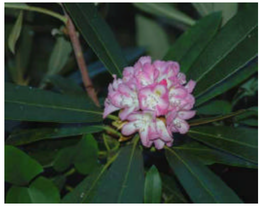
Pink R. maximum along Forge Creek

The area near Forge Creek was originally a virgin hemlock forest (Tsuga canadensis) with magnificent trees that were hundreds of years old. Sadly, the entire hemlock forest has been devastated in just a few years due to an alien pest, the hemlock wooly adelgid. Most of those huge trees are now dead. With more light, the rhododendrons are now blooming with abandon. We see not only whites, but also light to medium pink forms, too. An interesting thing about the dense shade provided by R. maximum is that it not only reduces diversity at the woodland floor but surely must inhibit forest regeneration. It is not clear what tree will eventually replace the hemlocks in the centuries to come.